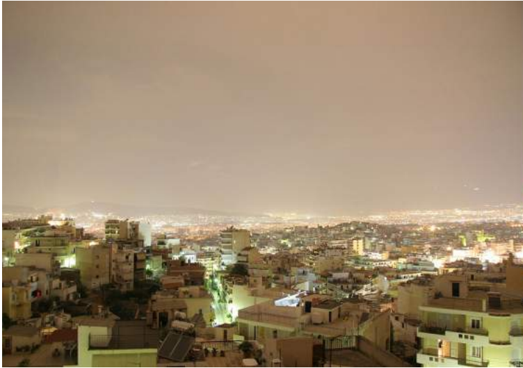
Out Here , Chrissou Voulgari 2014