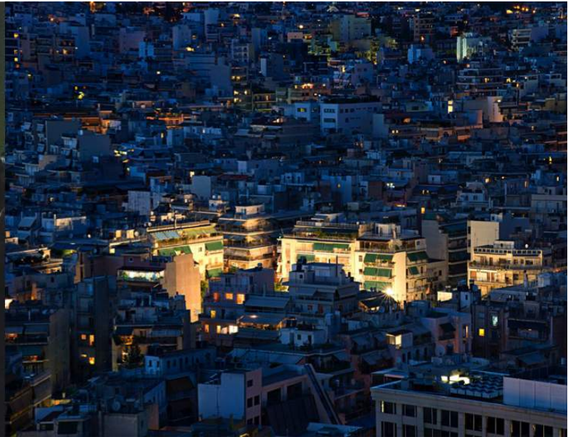
Athens Spread , Yorgis Yerolymbos 2012