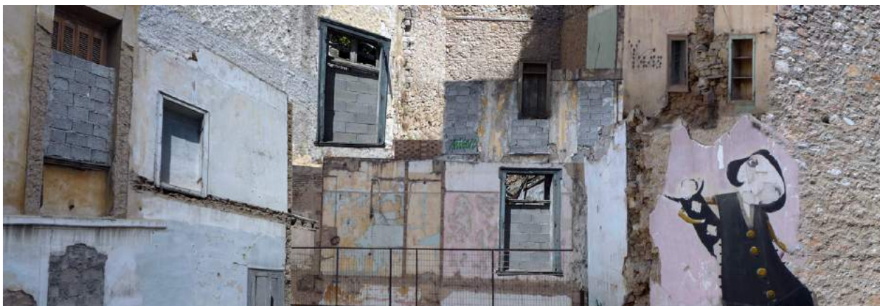
Hidden Wall, Metaxourgeio, Drifting City, 2010